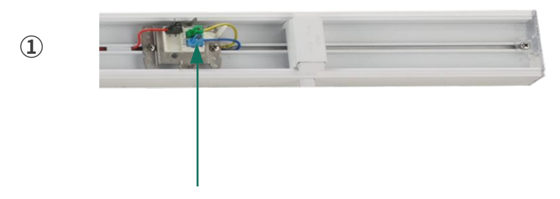
Choose position L1/L2/L3