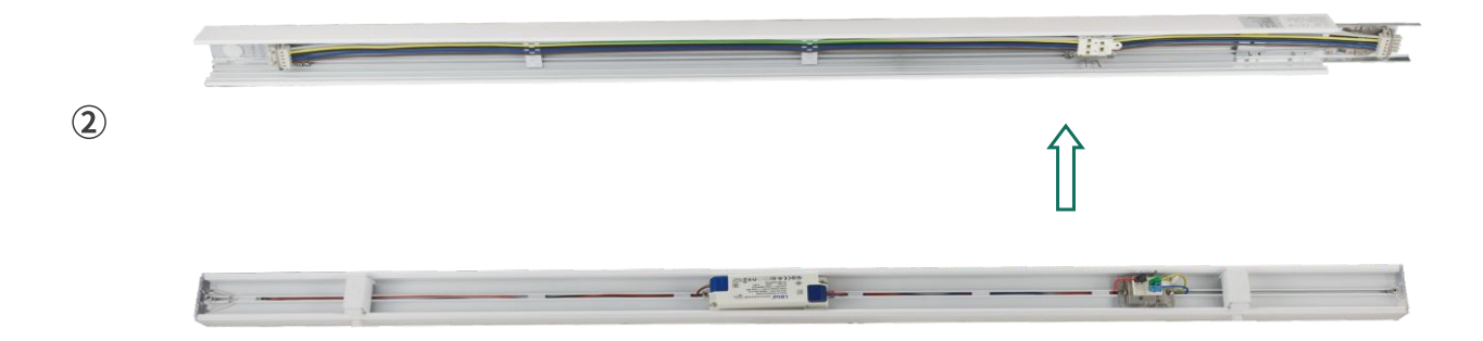
Connect cable and conduit